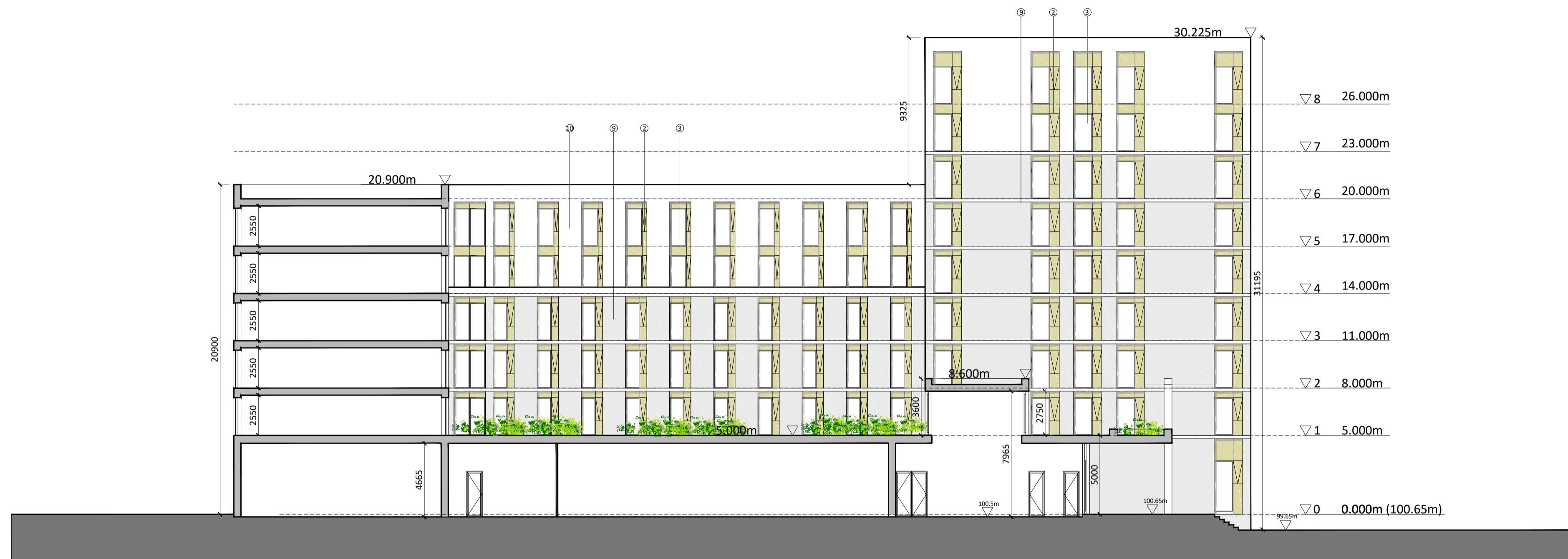
EAST CONTEXTUAL ELEVATION SECTOR 2 - ELEVATION HH SCALE 1:200